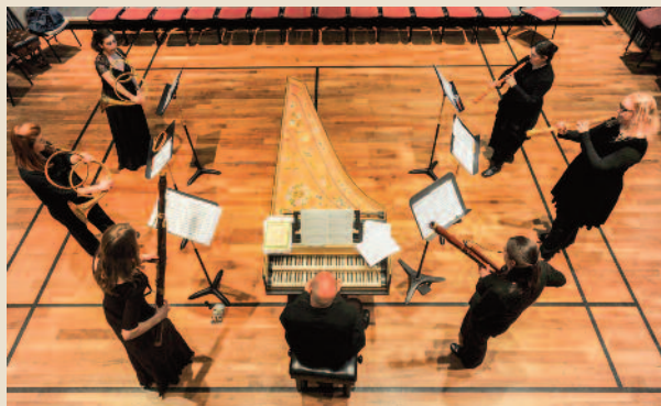
Syrinx – ensemble in residence

Festival Season Ticket top-price tickets for all five concerts £82